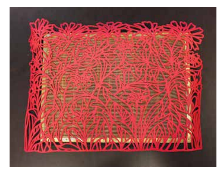
This rubber placemat material makes a wonderful watermarking stencil.