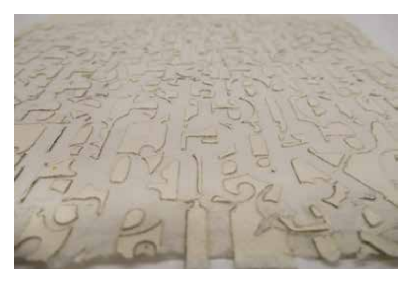
Detail of a "typorelief" cotton sheet made with a laser-cut stencil, by Isabella Kohlhuber.