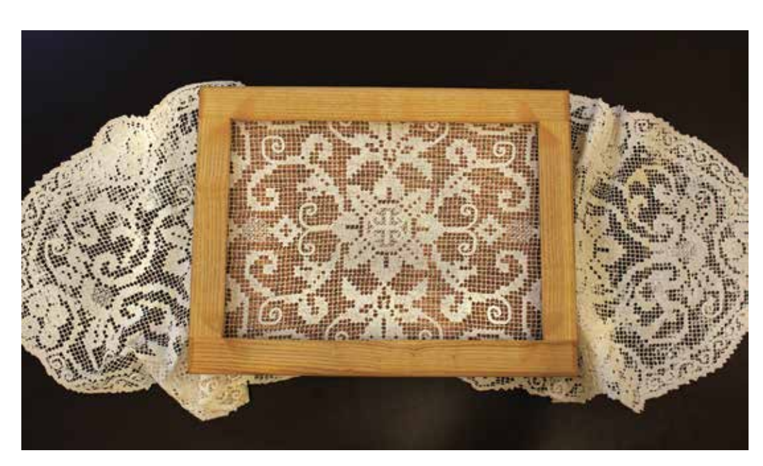
Sandwich a piece of lace between the mould and deckle for a watermarking effect, then leave the lace in place during pressing and drying to accentuate the lacy pattern on the surface of the paper.