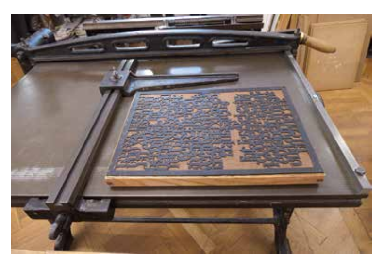
Laser-cut rubber material used as a block-out stencil on the papermaking mould, by artist Isabella Kohlhuber. Note the margin around the design so that the deckle can hold the stencil in place during sheet formation.